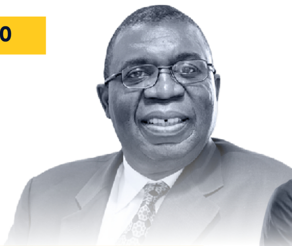
Prof Fholisani Sydney Mufamadi

https://www.youtube.com/c/NelsonMandelaUniversity